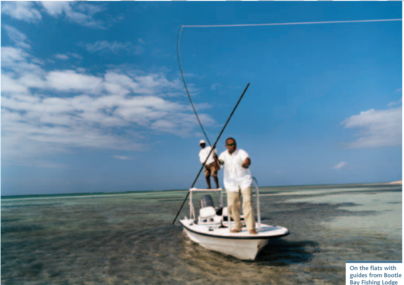
On the flats with guides from Bootle Bay Fishing Lodge