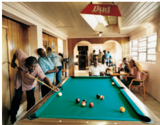
Clockwise from top: Port Lucaya's Count Basie Square; Gold Rock Beach; the wetlands of Lucayan National Park; pool at the Chicken's Nest

GAMBLERS Last December, the 19,000-square-foot Isle of Capri Casino —across from the Westin and the Sheraton—opened in Port Lucaya, a touristy open-air mall where you'll find souvenirs like Androsia batik sarongs, duty-free liquor, and polished conch shells. The Port bustles with shoppers, pub patrons spill onto the walkways, and restaurants serve sweet Caribbean lobster tails (try Fat Man's Nephew , overlooking colorful Count Basie Square). Don't expect to mingle with Bahamians