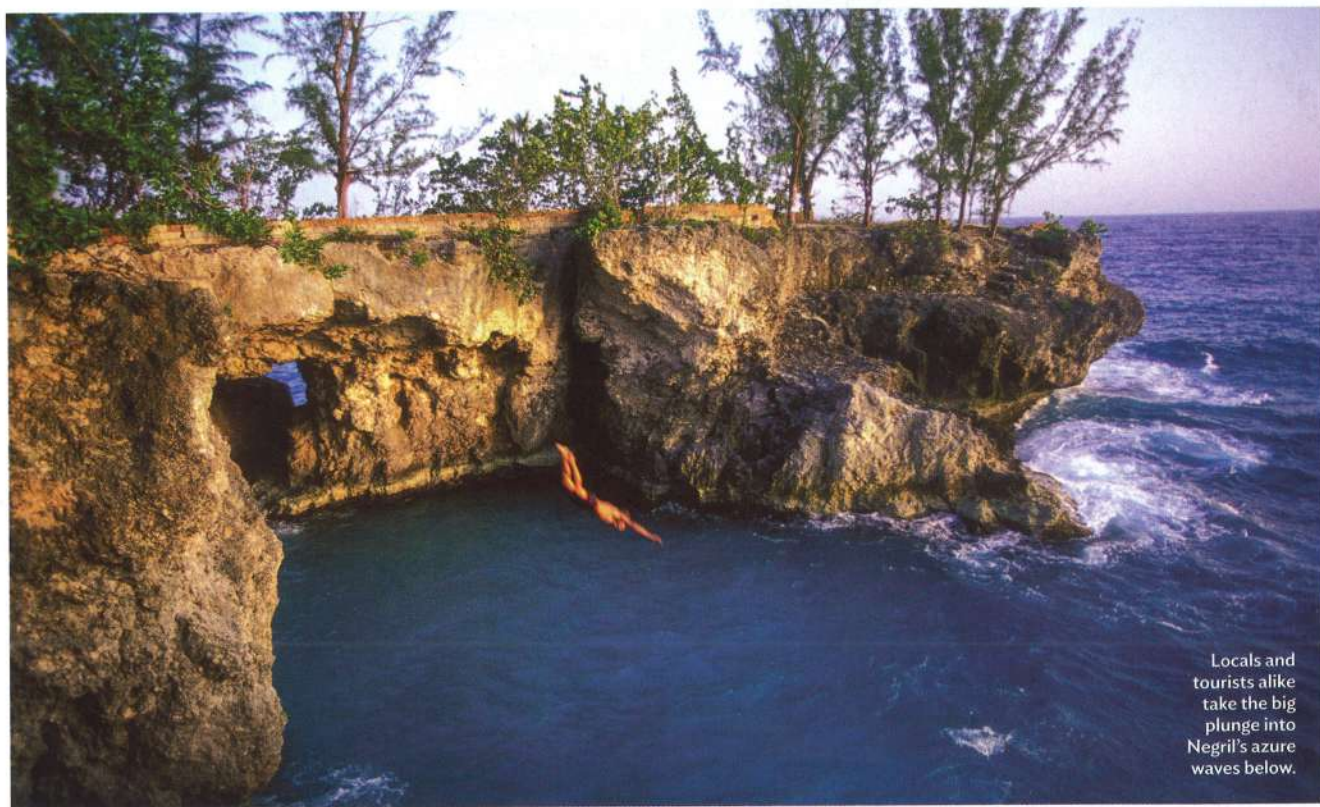
Locals and tourists alike take the big plunge into Negril's azure waves below.