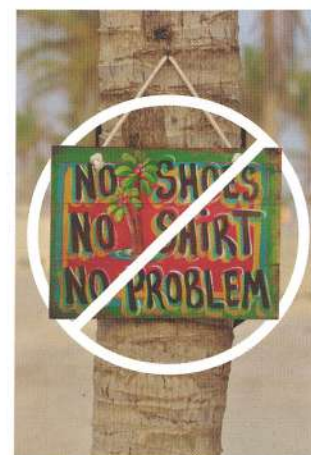
BERMUDA TOURISM (2); IMAGEBROKER/ALAMY STOCK PHOTO; ALEXANDRA MOSHER STUDIO JEWELLERY

DON'T FORGET: Bermuda is located in the Atlantic Ocean about 650 miles due east of Cape Hatteras, North Carolina. Simply put, it's nowhere near the Caribbean, which means "No Shoes, No Shirt, No Problem," does not apply. Unless you're at the beach or pool, make sure you're wearing a shirt or cover-up to avoid stares from locals.